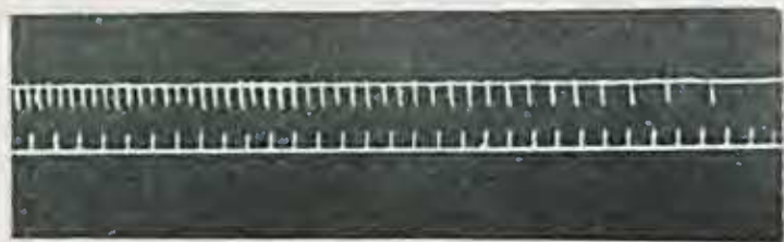
Fig. 2 — Upper tracing, drop record; lower tracing time 6 sec. intervals.

Adaptations — It is possible to use the circuit before the transformer to make visible and audible the falling drops using a neon lamp and a buzzer or to adapt a loudspeaker after the transformer which is useful for controlling at distance the variation in frequency and for demonstrations purposes. The current and voltage are sufficient for the buzzer loudspeaker and ionization for the neon lamp. It is always useful to use a time recorder (fig. 2) when the